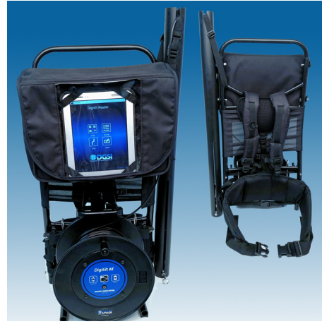
Easily take the AT system anywhere with our custom backpack

Extension Cables: Extension cables can be utilized to extend the length of a Digitilt AT System. Please note that extension cables are only compatible with detachable probes.