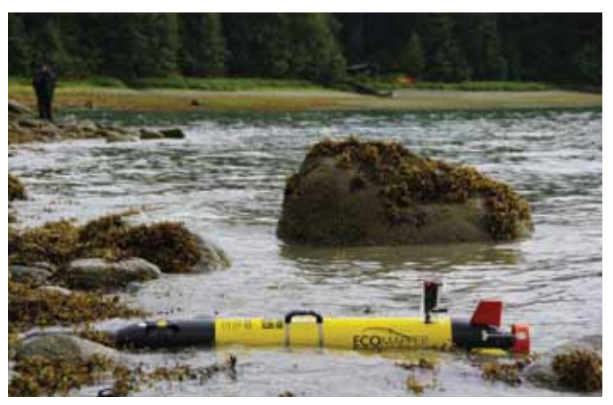
YSI EcoMapper AUV collected bathymetric data across two lakes in a remote Alaskan mountain region

The bathymetry model required high-resolution data, down to one-foot contours, to accurately assess the lake features down to forty feet. A previous model of the headwater lake, which used a sonar instrument on a boat, yielded five-foot elevation contours of the lake bed and banks.