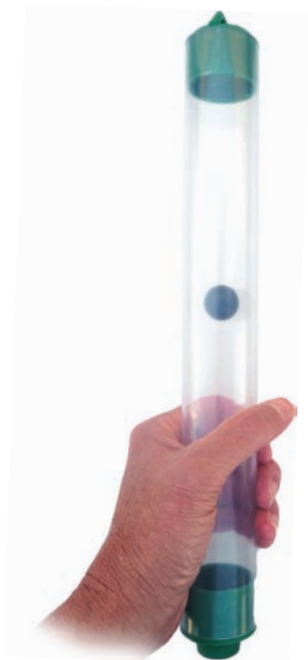
Model 428 BioBailer