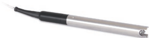
Model 122M P8 Probe

The 122M uses the P8 Probe, which is 5/8" in diameter (16 mm) and stainless steel. It is pressure proof, up to 500 psi. The beam is emitted from within a Hydex cone-shaped tip. The tip is protected by an integral stainless steel shield, and is excellent for the vast majority of product monitoring situations. A cleaning brush is included with each Meter.