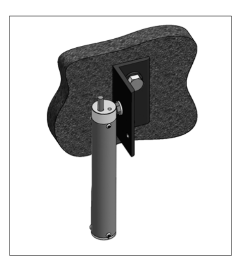
The tiltmeter can be fixed to most structures via the included angle bracket. The bracket can be anchored to rock or concrete and welded to steel.