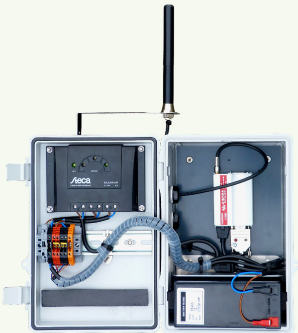
GPRS-DLC-BX1/SP and GPRS-BX1/SP Modem Box

The GPRS-DLC-BX1/SP and GPRS-DLC-BX1/B systems include an enclosure, battery, quad band modem, smart SIM, 10Ah battery, cables, antenna and mounting kit for fixing to masts or poles (42-51 mm dia.). In addition, the GPRS-DLC-BX1/SP version includes a 30W solar panel with brackets for mast/pole fixing. Please note that the logger (ordered separately) has to be mounted outside the modem box. A line rental and data package are also required to complete the system and must be ordered separately. To ensure your modem system exactly meets your needs, please request a quotation.